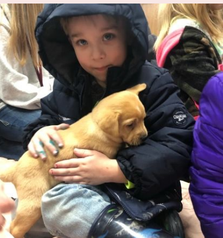
Weekly visits with Animal Vet Science Program